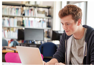
WALTON-LE-DALE AND ASHTON-ON-RIBBLE PUPILS JOIN DIGITAL SKILLS SESSIONS