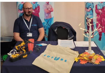
FUTUREU SPONSORS LANCASHIRE'S BIGGEST CAREERS FAIR, 'BLACKBURN IS HIRING'