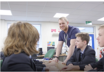
FUTUREU RECEIVES 850K FUNDING BOOST

To find out more information and to book activities please contact your Future U Senior Officer who will be happy to help.